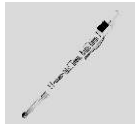
TM.7102 Jam/Sugar Thermometer -25C/200C