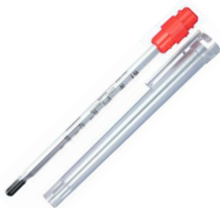
TM.18348 Chocolate Thermometer 5C/60C