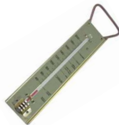
TM.21583 Sugar & Jam Brass Thermometer