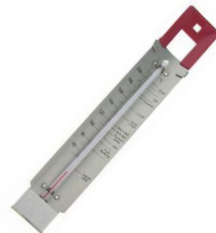
TM.21588 Sugar Thermometer Stainless Steel