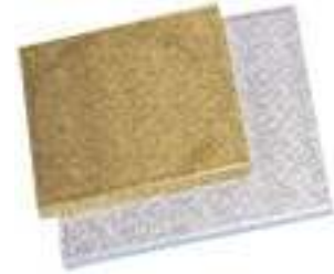
CBD12-10 - 12mm 10" Diamond Drum - 5 CBH12-08 - 12mm 8" Hexagonal Drum - 5 CBHR12-10 - 12mm 10" Heart Drum - 5 CBO12-08 - 12mm 8" Oval Cake Board - 5 CBOB12-08 - 12mm 8x12 Oblong Drum - 5 CBP12-12 - 12mm 12" Petal Cake Board - 5 CBR12-08 - 12mm 8" Round Cake Board - 5 CBR12-08G - 12mm 8" GOLD Round Drum - 5 CBS12-08 - 12mm 8" Square Cake Board - 5 CBS12-08G - 12mm 8" Square GOLD C.Board